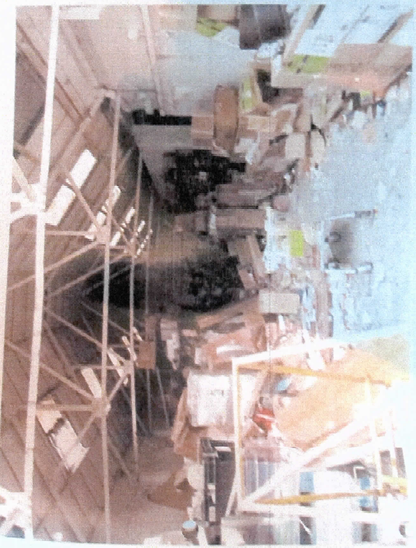
View into one of the warehouse compartments