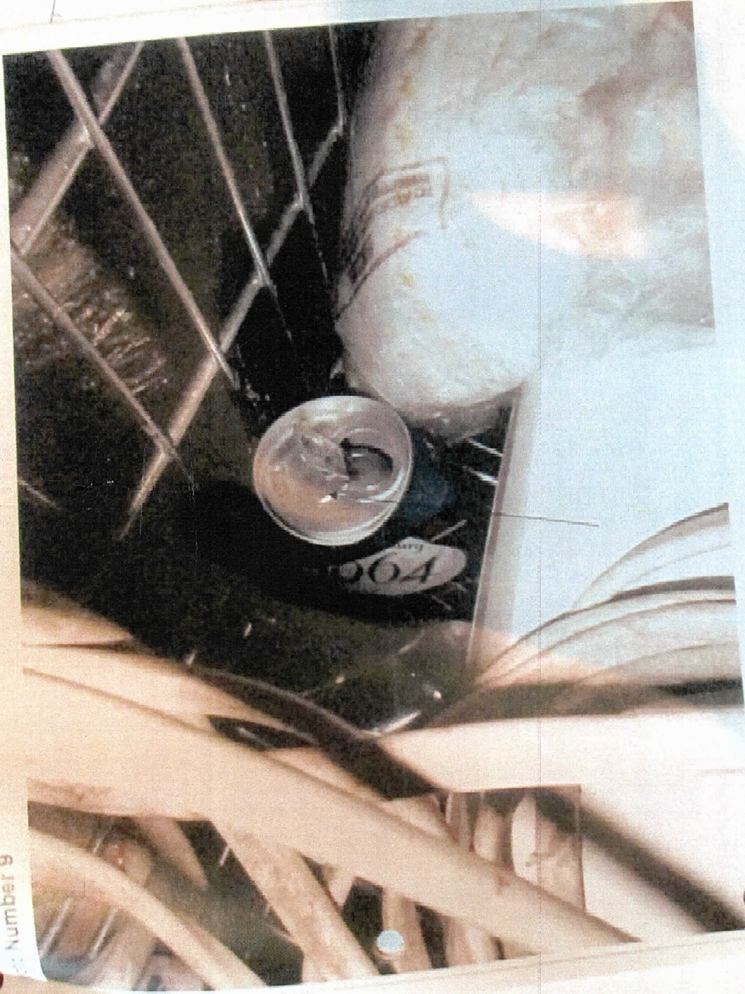
Drink can inside trolley

Print name: MCCAFFREY Date: 8/2/05 Reviewing lawyer signature: [Signature]