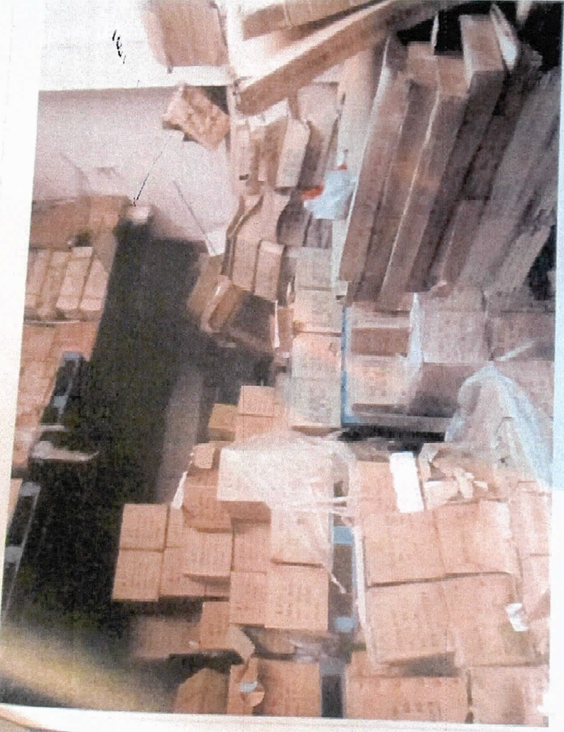
View inside the warehouse facing to a quantity of boxes, a concealed passageway behind these boxes