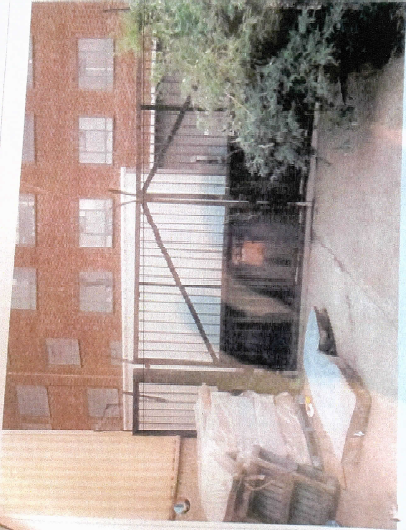
View looking back away from the warehouse to the front security gates